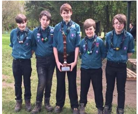
Scouts' Totem 2014